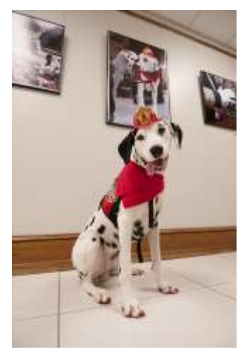
Figure 1 Molly the Fire Safety Dog. Photo courtesy of the Arkansas Secretary of State's Office